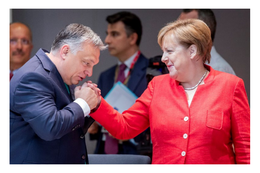
Géopolitique / Geopolitik / Geopolitics "'Hello Dictator' - Victor Orbán Versus Europe"

This slot compiles and analyses political, geopolitical, socio-political and economic questions and phenomena across Germany, France, Europe and the world. The objective is to provide viewers with a deeper understanding of the broader contexts and interconnecting influences that shape current affairs. The main focus is on under-reported topics affecting the world today and those which raise major political, economic and social questions. The slot is open to both classic documentaries and new documentary formats.