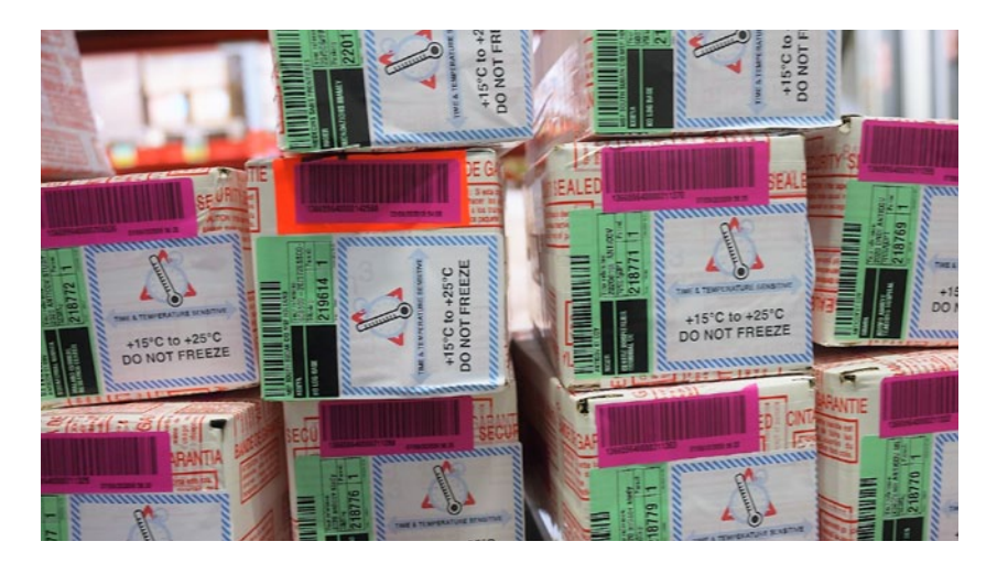
Desperately wanted, unfairly distributed? The risky run for a corona vaccine

DESPERATELY WANTED, UNFAIRLY DISTRIBUTED? THE RISKY RUN FOR A CORONA VACCINE (28') Corona has pushed vaccine research in an unprecedented way. More than 200 projects are currently underway. While every country is building up its own network to get its population vaccinated in a complex process of priority-setting, there is little transparency on an international level. Who will get hold of the first batches of vaccine? Under the umbrella of the World Health Organization, a platform called Covax has been established. Its aim is to guarantee that its members buy vaccines collectively and are allocated a fair share according to a certain distribution key. But while many states contribute to Covax financially, most