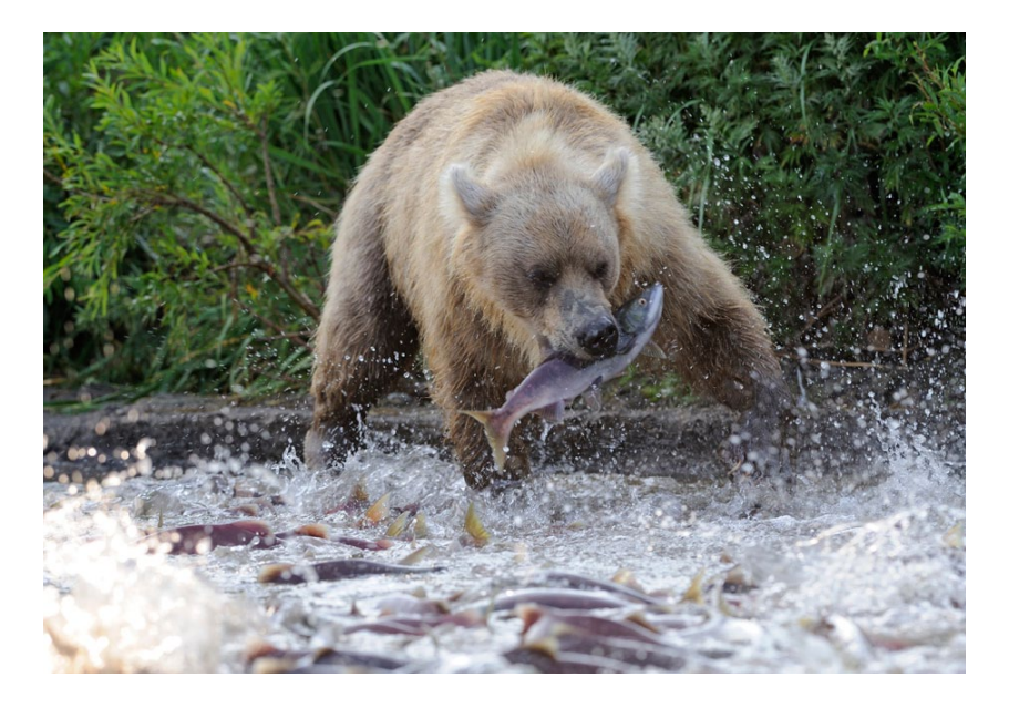
Kamchatka – Under the spell of the red fish

planet e. explores the secrets of sockeye salmon and gives fascinating insights into their life.