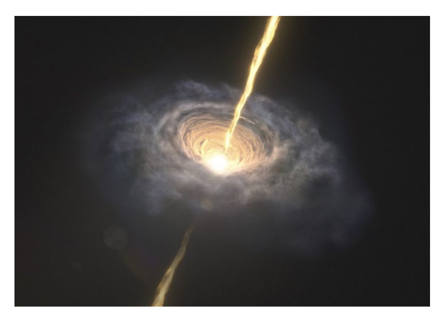
Sciences / Wissenschaft / Science "Life from outer space"

rylines will be followed in relation to a clearly stated and identifiable theme. Guests and interviewees will be acknowledged experts, vouching for the scientific credibility of the content. At the same time, they must be capable communicators, able to explain complex items in a comprehensible way.