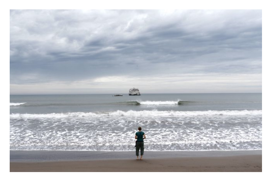
Aware - Glimpses of Consciousness

AWARE – GLIMPSES OF CONSCIOUSNESS (102') What is consciousness? Is it in all living beings? What happens when we die? And why do we seem to be hardwired for mystical experience? In these times of existential crisis, there has been an explosion of research into consciousness - and scientists are confronting the Big Questions. AWARE follows brilliant researchers, approaching the mystery from radically different perspectives, from within and without: through high-tech brain research and Eastern meditation, by scientifically exploring inner space through psychedelic substances and by investigating the consciousness of plants.