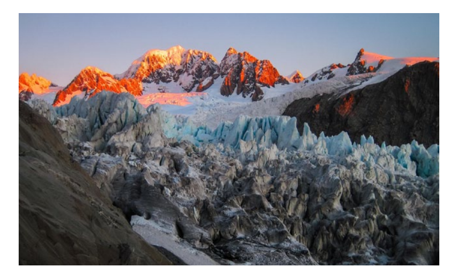
ARTE Découverte / ARTE Entdeckung / ARTE Discovery "New Zealand from below"

relating to travel, nature, wildlife, and science. The purpose is to draw viewers into these diverse and highly attractive worlds.