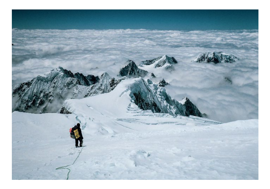
Cinéma Documentaire / Großer Dokumentarfilm / Big Format Documentary "The Wall of Shadows"