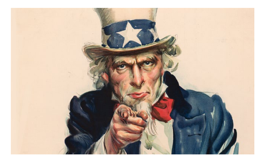
Thema du Mardi / Thema am Dienstag / Tuesday's Theme "Propaganda – The Art of Selling Lies"