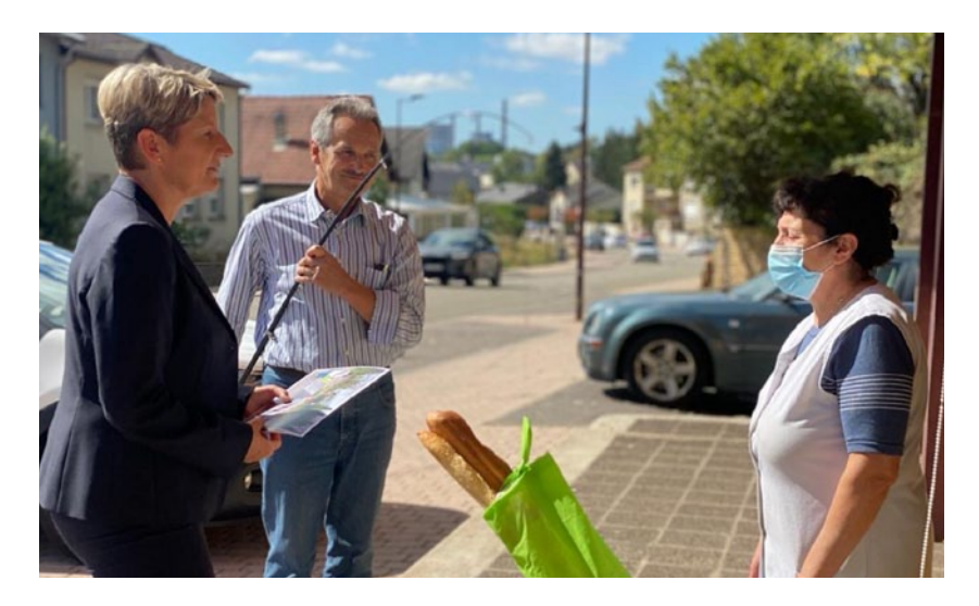
The European Patient. How a virus is changing our continent