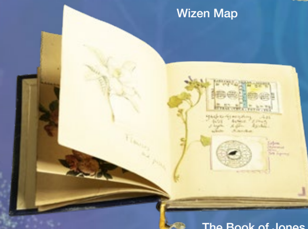
The Book of Jones