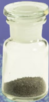
Magic Black Dust