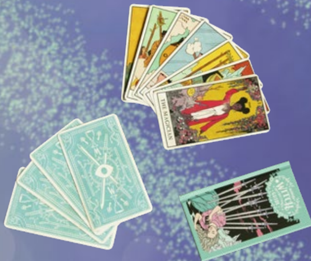
Simone's Tarot Game