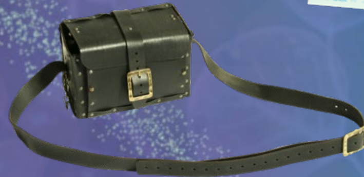
Toolbook and vials wizesence