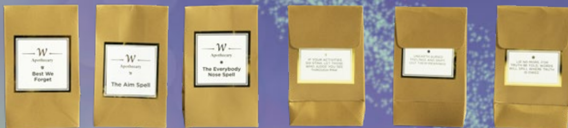
Packets of Herbs