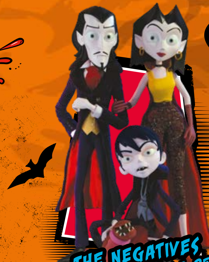
THE NEGATIVES ALSTON, BELLA, RESUS AND LULU THE LEECH

Cleo's dad, Niles Farr, is a single not-so-bright parent. He's a former pharaoh but like almost all Egyptian Mummies he had his brain removed when he died. Niles is a go to for slapstick silliness. He's devoted to Cleo and always trying to look out for her – but his lack of brains means she's basically looking after him.