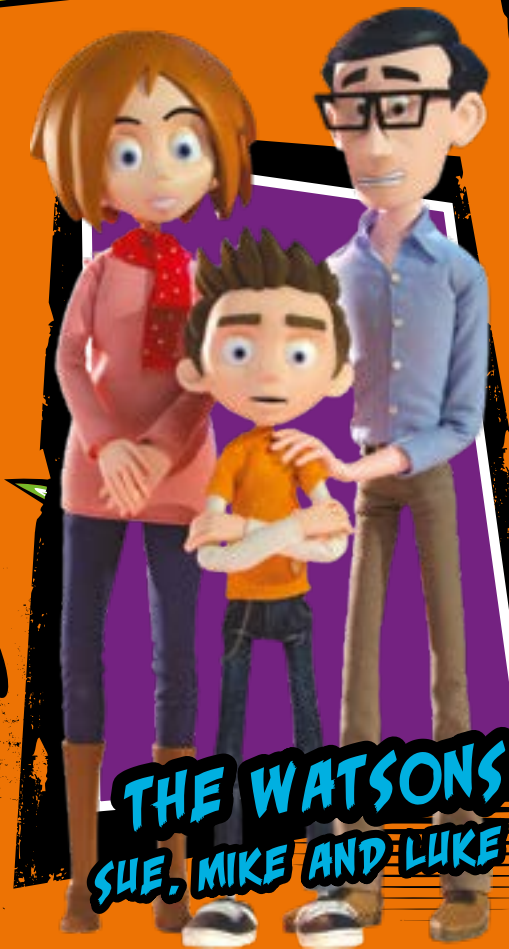
THE WATSONS SUE, MIKE AND LUKE

The Watsons now live at number 13 Scream Street. Unlucky for some? Yes – for the Watsons. Outside Number 13 is a sign: Beware of the Werewolf.