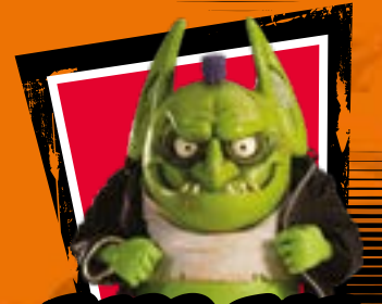
FARP THE FARTING GOBLIN