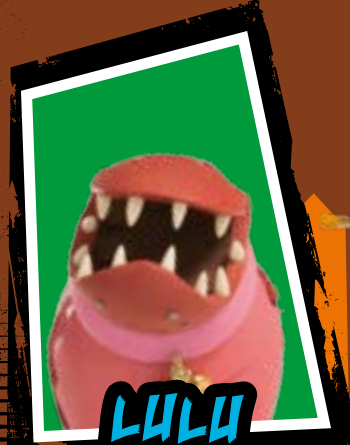
LULU THE LEECH