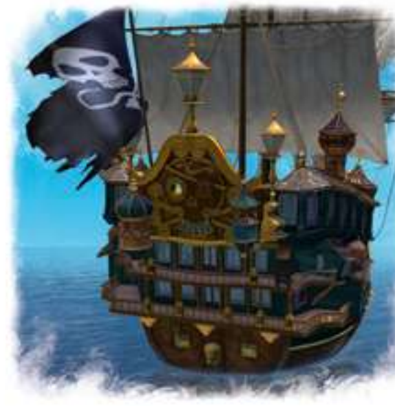
The jolly roger - 2