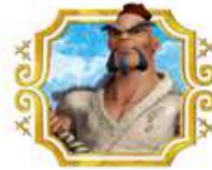
Chuluun - Jud Niven