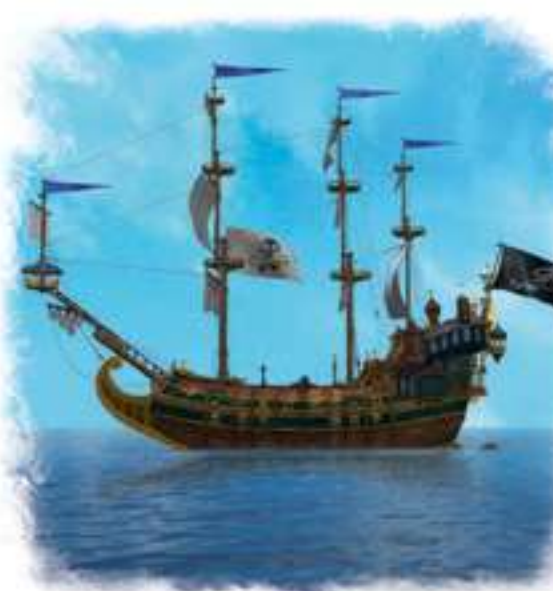
The jolly roger - 1

Below this deck is the hold where prisoners, barrels of rum and weapons are kept. Separately, of course. When there are any on board.