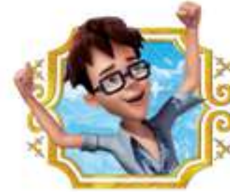
Stringbean - Cole Howard